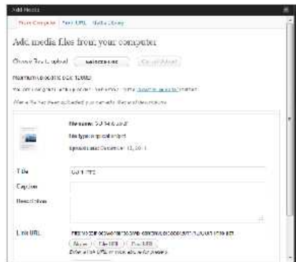
Fig.3 Upload PDF File

WordPress also provides file upload feature where educators can upload various types of file including PDF file. The process to upload PDF file in WordPress is very easy by just clicking "Add Media" icon above WYSIWYG (What You See Is What You Get) editor when educators want to write new content. They can upload PDF file from local computer or from other websites.